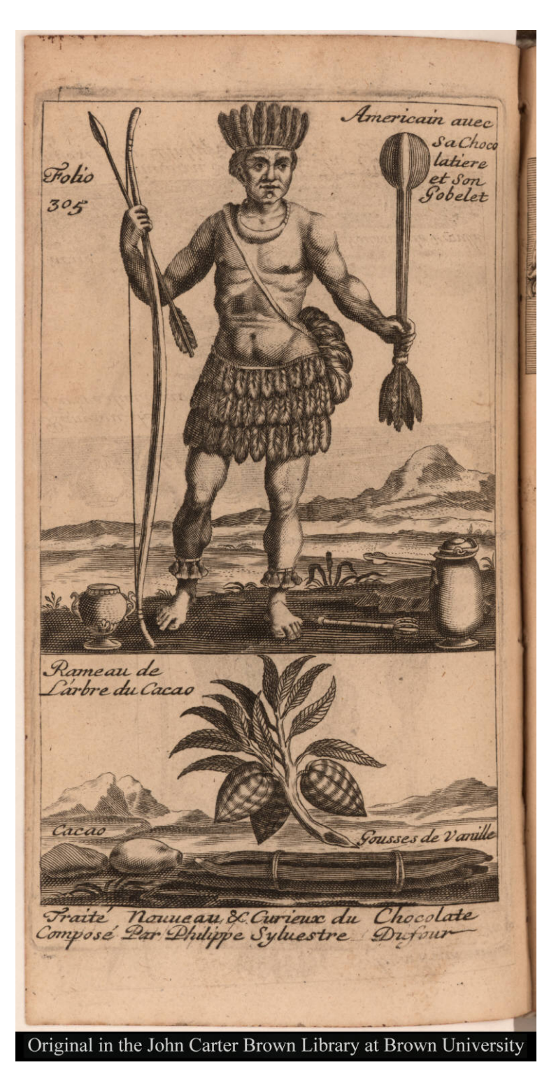
Fig. 1. Philippe Sylvestre Dufour, Traitez nouveaux et curieux du café, du thé et du chocolate (Lyon, 1685). An Amerindian is depicted here with the cacao plant and chocolate paraphernalia.