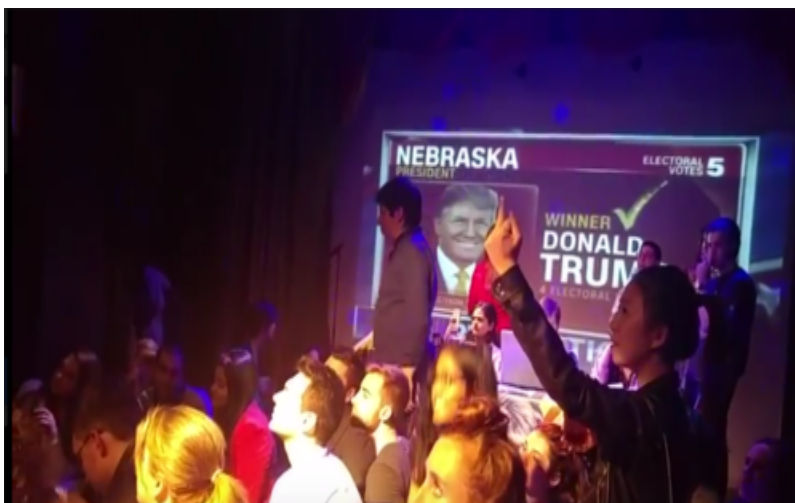
11:16 PM. Trump wins Kansas, Nebraska, Wyoming, North and South Dakota