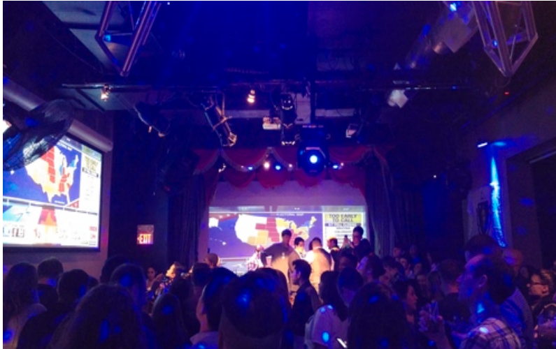
9:01 PM Trump wins Texas and Arkansas. Clinton wins Vermont, New York, Massachusetts, and Indiana.