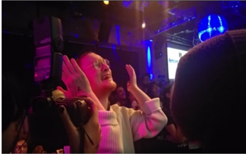
10:00 PM. Trump wins Montana.