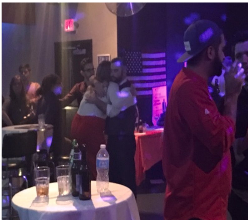
12:03 AM. Trump wins Florida.